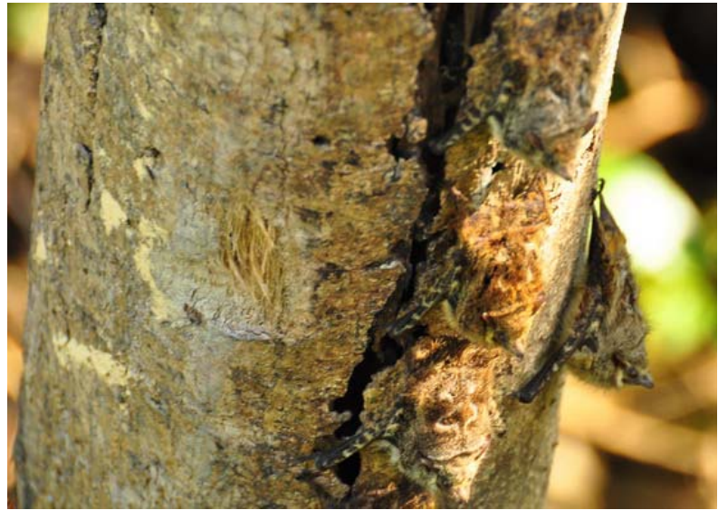
tiny proboscis bats