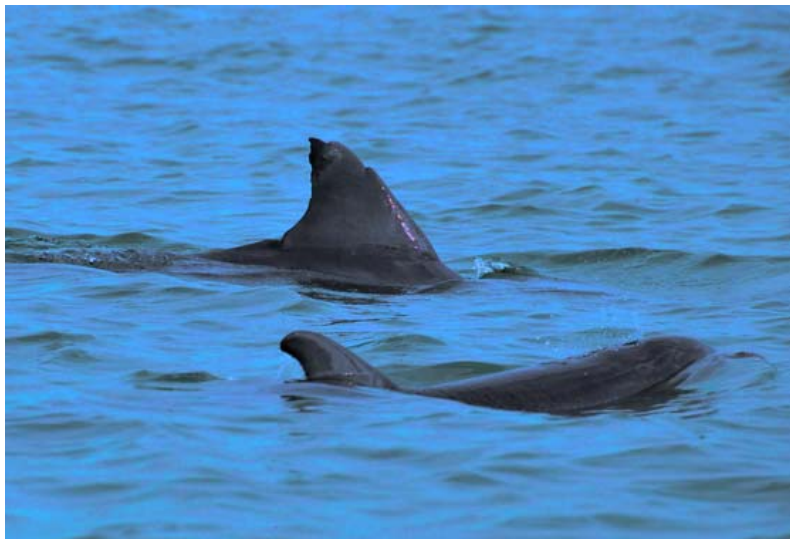
Dolphins on Lagoon