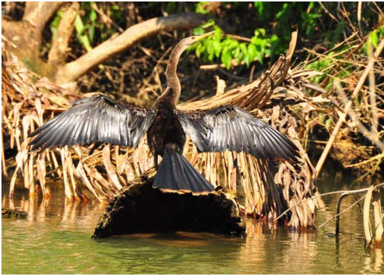
Aninga Drying Wings