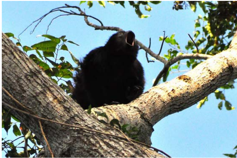
Howler Monkey Roaring