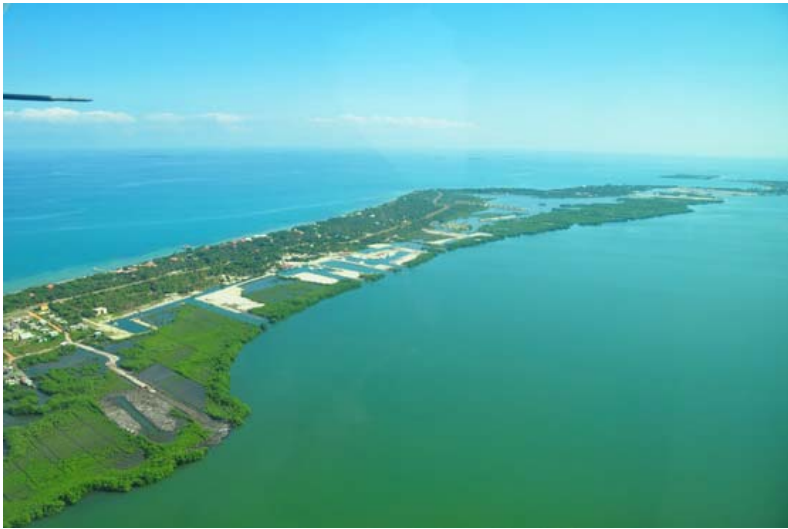
Placencia Peninsula, Belize