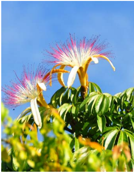
flowers of provision tree