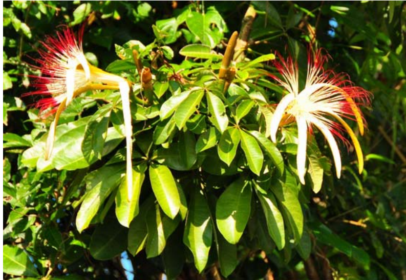
flowers of provision tree