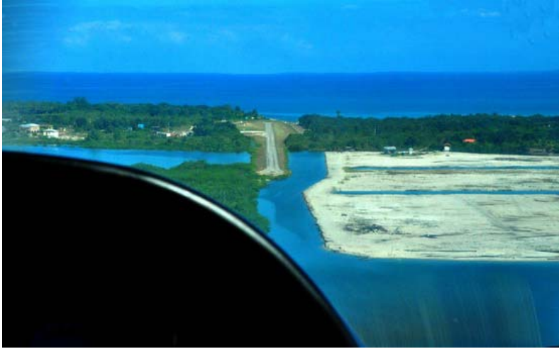
Landing at Placencia in Tiny Place