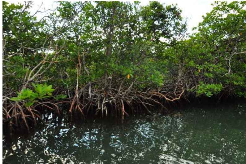
mangroves on lagoon at Placencia