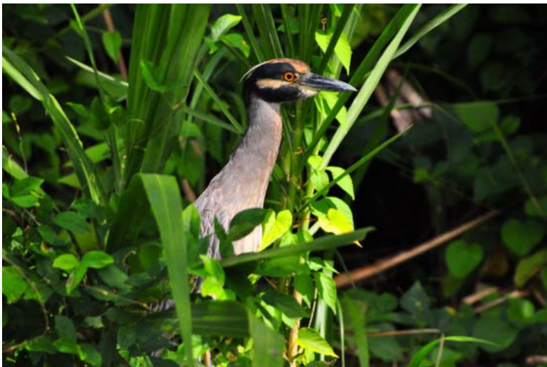
Yellow Stripped Heron