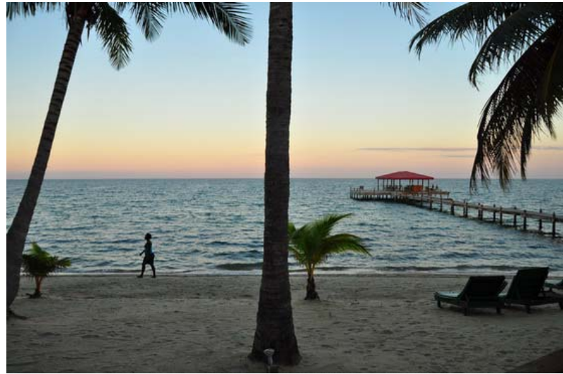
View from Inn at Robert's Grove