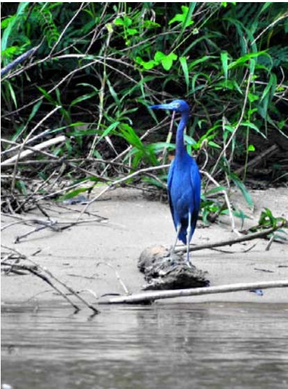
very blue heron