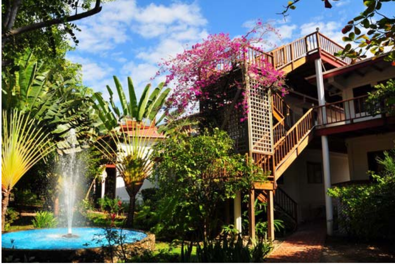
Aszlias and Fountain at Robert's Grove