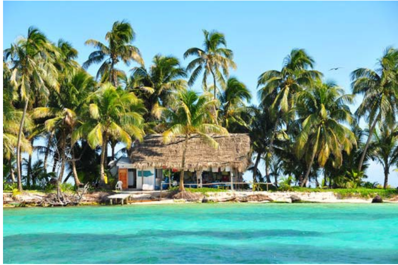
Ranguana Island Headquarters