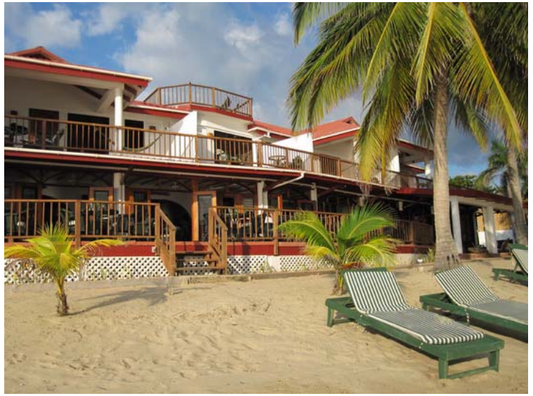
Inn at Robert's Grove in Placencia