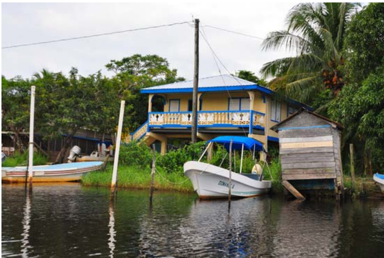
Typical Belize House