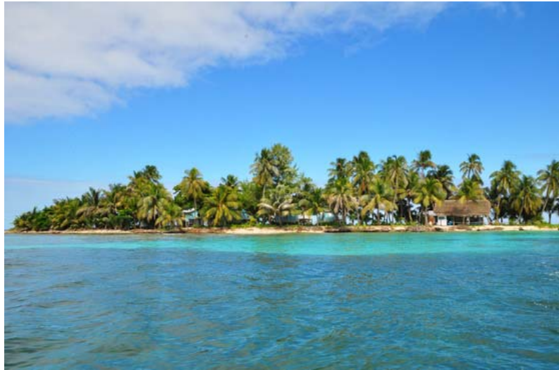
Ranguana Island for Snorkling