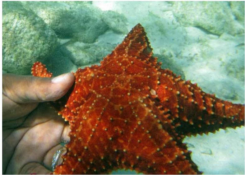
Live Star Fish