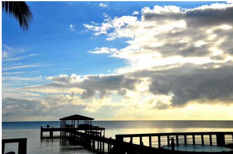
Morning Sun on Pier at Robert's Grove