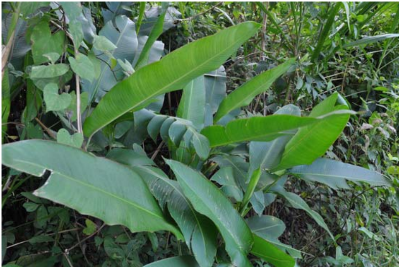
Rubber Plants growing an inch per hour