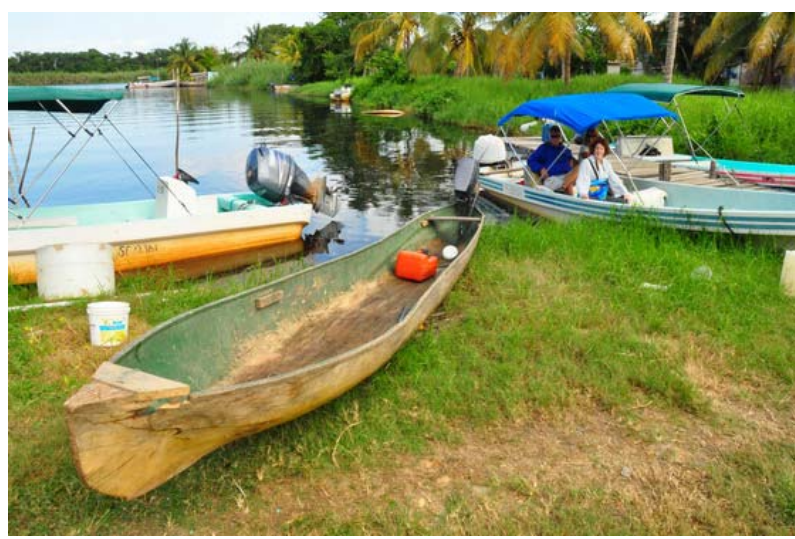
Dugout Canoe at Monkey River Village