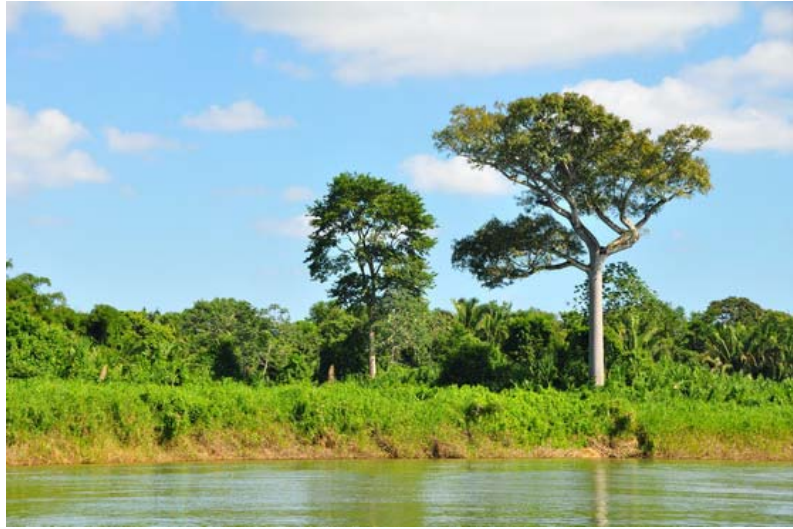
giant ceiba tree