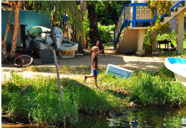
Boy Line-Fishing at Monkey River Village