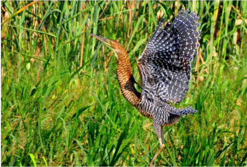
tiger striped heron