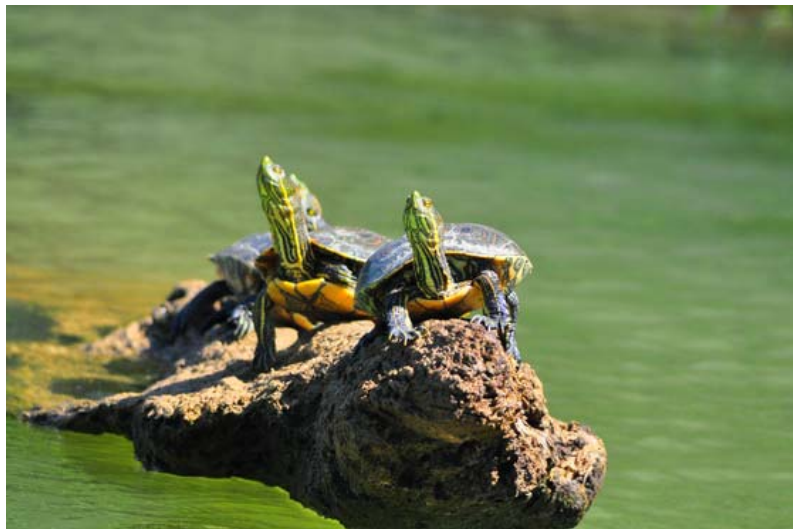
Turtles Sunning in Monkey River