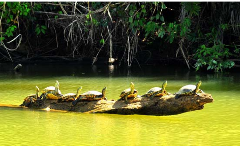
Turtles Sunning in Monkey River